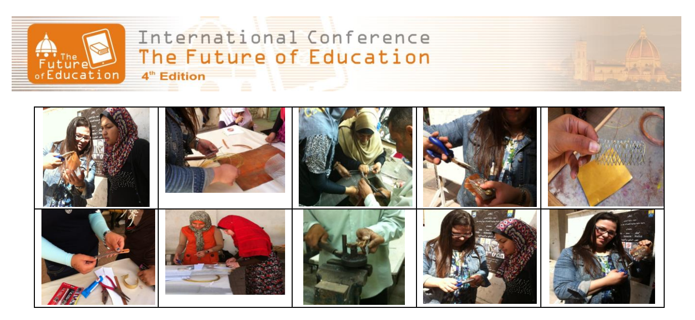
Fig.11.Stage of Directing and Solving the Creativity Problems