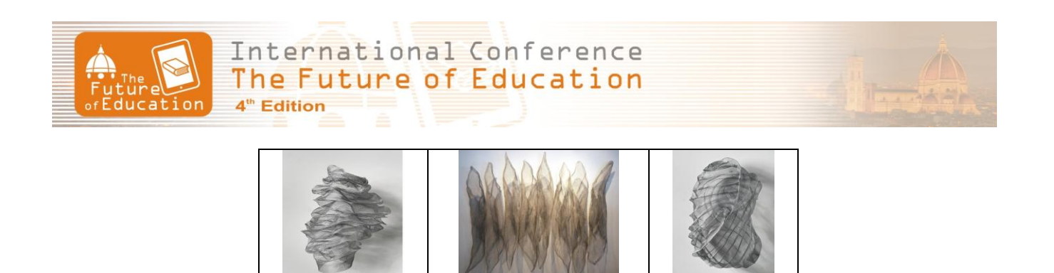
Fig.5.Boebel Sculpted Of Aluminum Wire Screen