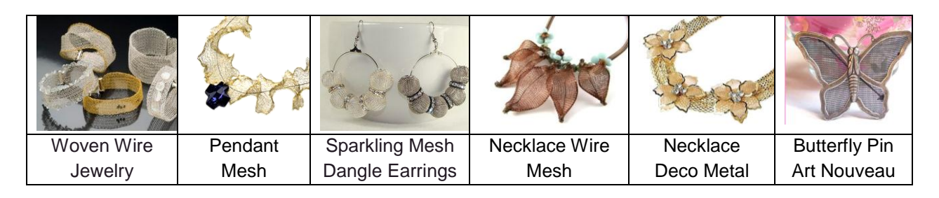
Fig.4.Group of Unique Modern Jewelry Using Expanded Metal Mesh

Using mesh in jewelry design had doubt that the mesh would be scratchy or uncomfortable to wear, while the texture is soft and supple [4]. It is very easy to manipulate. It's perfect for creating leaves or wave effects. Menoni was one of the first to identify the potential for this material in fashion jewelry with predefined specification and colors .It is used in so many designs, in different ways to use wire mesh ribbons [6].