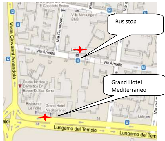
Grand Hotel Mediterraneo, Lungarno del Tempio, 44