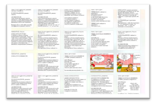
Fig.5. Students' branch of Peartrees

The collections of student artifacts were selected and gathered in an e-book of Albanian grammar. Writing is an activity that helps consolidate learning, but the student content is also an important factor. We used epubeditor (<a href="http://www.epubeditor.it">http://www.epubeditor.it</a>), an online environment for creating easy ebooks in epub3 format.