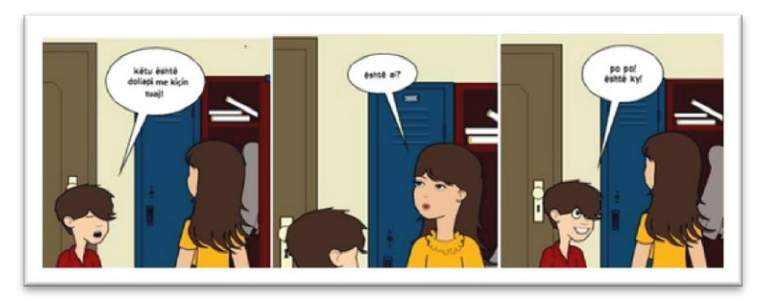
Fig.2. Comic strip "Në Shkollë"

• pixton (<a href="http://www.pixton.com/">http://www.pixton.com/</a>) a software to create a comic strip to tell a story drawing the scenes sequentially and with the emphasis on writing skills (fig. 2).