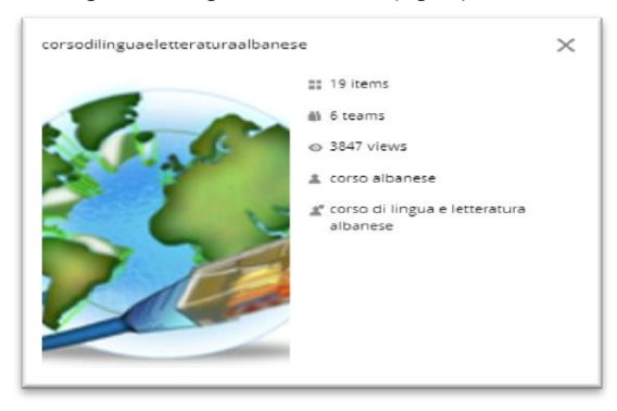
Fig.4. Pearltrees' dashboard

Each student used the Pearltrees software as a learning notebook to compile ideas, to make notes on their own progress and to catalogue sites, which contained useful learning material. The students worked in collaborative groups to co-construct sequences of grammatical rules which formed branches of Pearltrees, Everyone had the opportunity to choose the digital tool they wished to perform the task, and to see the work and progress of others navigating around the topics using hypertext links. We created six different teams on topics such as Glossary, Verbs, Pronouns, Nouns, Greetings. The students organized 19 items generating 3,800 views (fig. 4).