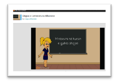
Fig.3. Cartoon "Introduce yourself"