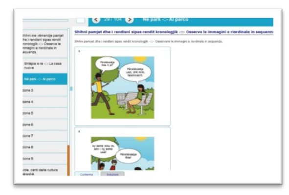
Fig. 6. Examples of the e.book