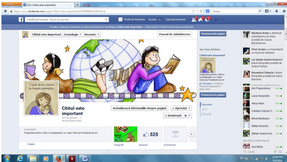
Fig. 1 – Printscreen for the Facebook page