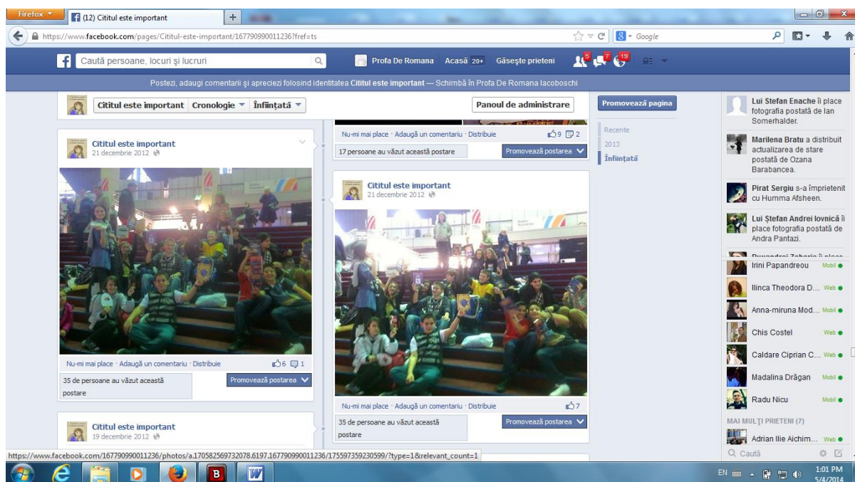
Fig. 3 – Pictures with the children at the bookfair