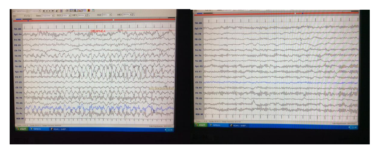
Table 2 . Anomalous graphoelements associated with a lesion in the left hemisphere (left) – at the end of the Bowen application within the H3AL protocol, the EEG showed a fully normalized brain activity (right).

Table 1 . A healthy brain in the waking active state (while reading, speaking and listening) – subject using the Bowen H3AL protocol. Such an intense presence of all measurable brain-wave frequencies (delta, theta, alpha, beta1-2, gamma) shows an apparently paradoxical state of consciousness described by the neurophysiologist performing the EEG as a brain simultaneously in a deep sleep and fully awake, that is a more highly activated brain.