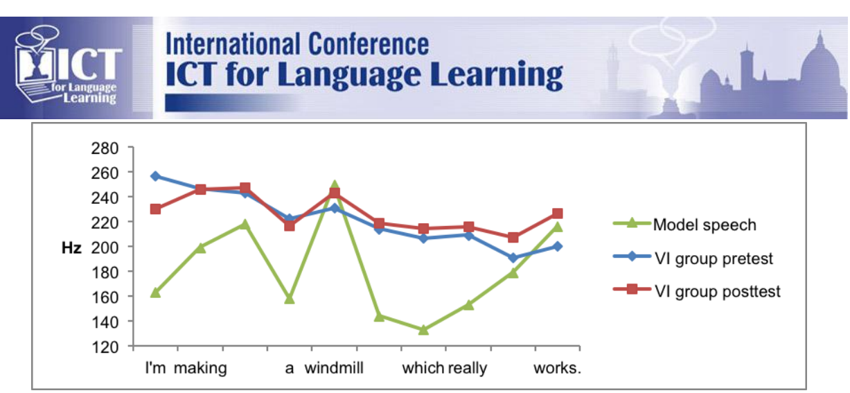
Figure 2 Median pitch contours of VI group (token 3)