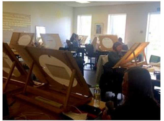
Figure 5. Animation and Creative Learning classroom

The biggest advantage between learning watching movies vs making movies, relies on the experiencing "the doing". By doing, our bodies get more sensorial data which the brain can use to create more relationships between concepts.