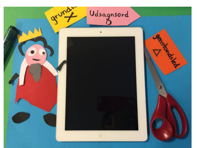
Figure 6. Animated Learning LAB, Denmark

Learning is growing and changing, as our bodies and brains do, they are plastic, let's use a plastic tool for our plastic organs to improve learning. We all are responsible at influencing the educational, scientific and professional industry. Animation is a tool to conceive, visualize and materialize ideas, charged of emotions and feelings that bring us alive.