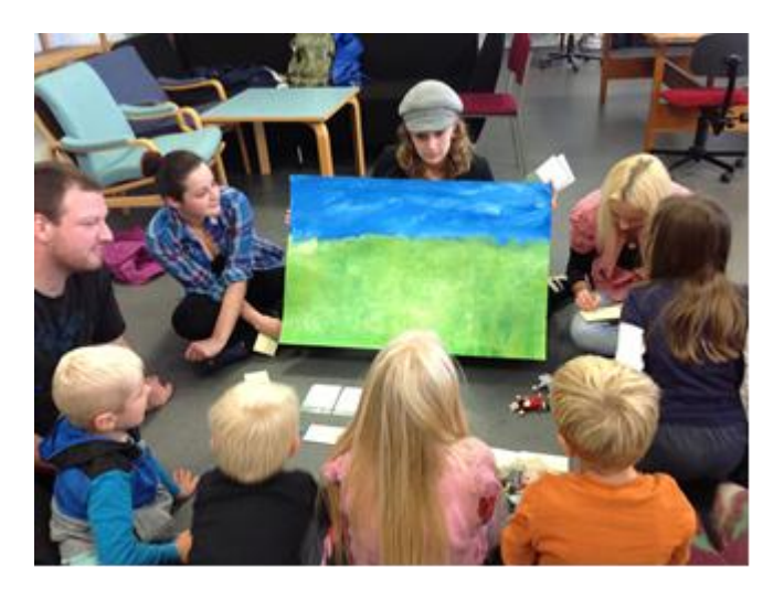
Figure 1. Animated Learning LAB. Children Workshop