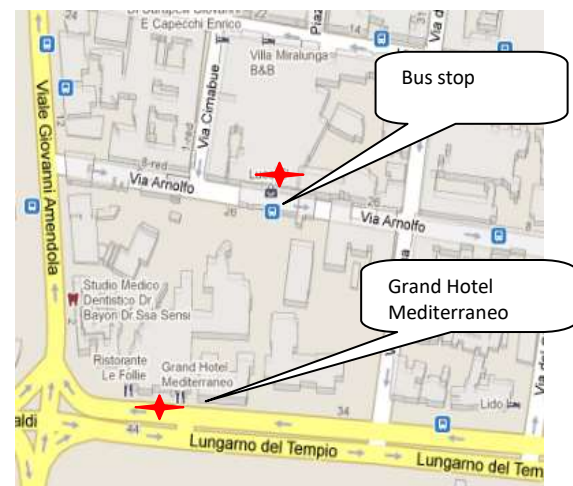
Grand Hotel Mediterraneo, Lungarno del Tempio, 44