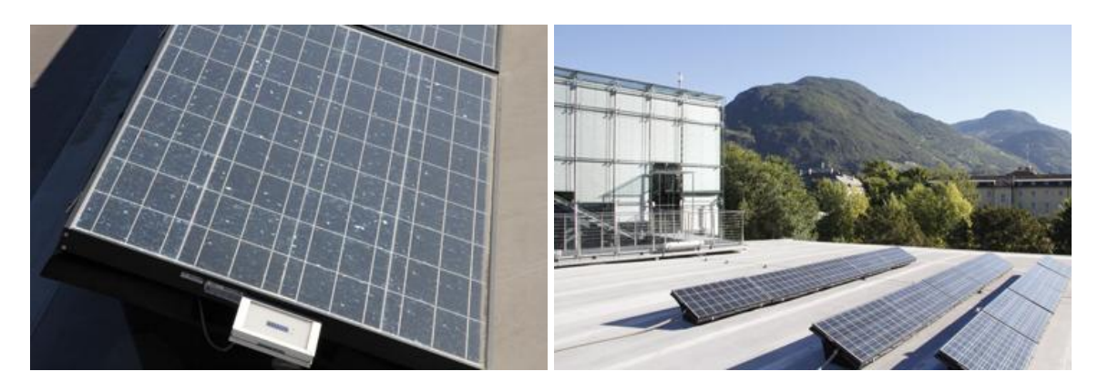
Fig.1. Solar photovoltaic plant

Afterwards they receive background information and specific presentations in order to approach the practical activities.