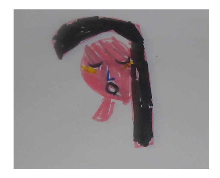
Fig.1.The number 1 drawn by a child with ACC activity after the recognition of the shape of the numbers in the objects and people in the life of every day.

The two children with agenesis of the corpus callosum ACC surveyed have not used in a satisfactory way or the geometric method nor recursive. Both children had difficulty linking to the figure number (symbol). An extremely creative visual method made it possible to overcome this barrier. The figure shows, for example, a fanciful representation of the number one.