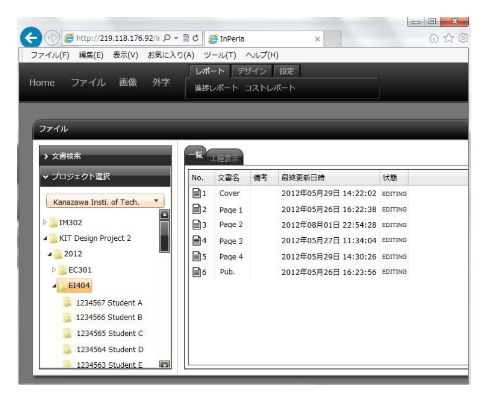
Fig. 1. Window of "PBL-InPeria" after login

Figure 2 shows the entry screen on the first page. After inputting text, an image data for the text is specified. Letter size, figure size, and data volume, etc. are adjusted by the automatic typesetting function of the system. After inputting, a PDF file is produced, and the finished one is checked. The produced booklet explains the history of the 15-week project. In Project Design in 2012, we instructed all students to produce booklets by using "PBL-InPeria.".