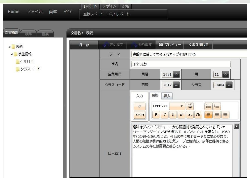
Fig. 2. Data inputting screen of "PBL-InPeria"