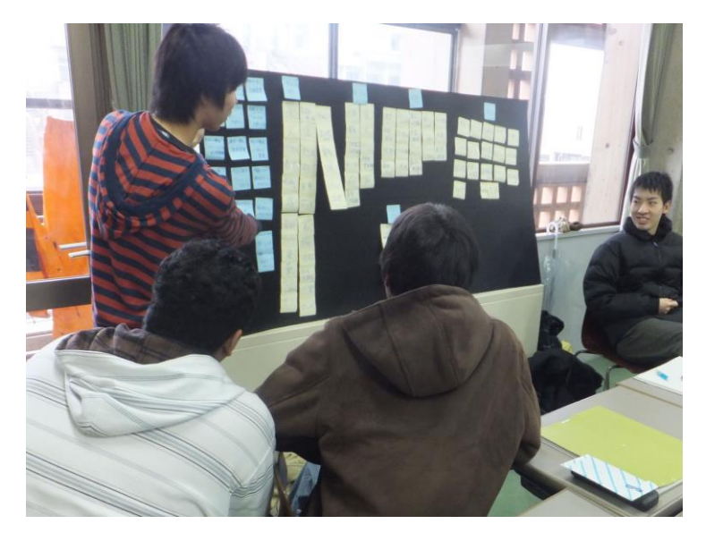
Fig.1. Figure 1. Scene of Brainstorming by Students.