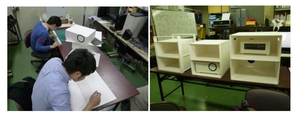
Fig.3. Prototype Production by Students.

could be processed easily. Students processed the boards by using a cutter, vinyl tape, and a glue gun. To verify the size and feeling of the 3D system, three prototypes were produced. Finally, the prototypes of the student productions were verified by an industrial designer and an engineer. Figure 4 shows the appearance of the verified prototypes.