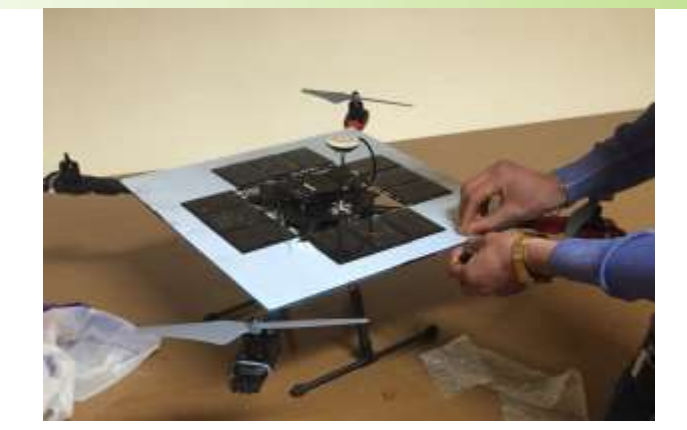
Figure 2 Position setting of the solar cells on the drone