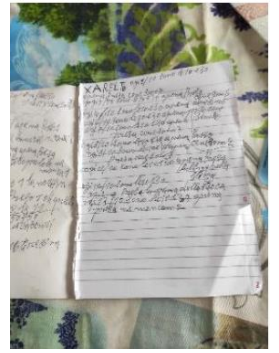
Figure 1 Diary of patient 76 old years

They demonstrate, with photographic material, the methods of taking medicines at home implemented by the over 65s in polypharmacy