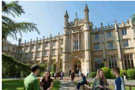
American Institute for Foreign Studies