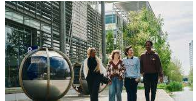
Richmond, American University in London 1972