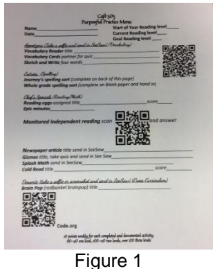
This menu can be adjusted as desired by the teacher. The items are checked off by the student as they are completed. At the end of the week students turn the menus in to be graded. There is a point system for the menus and the points are added to a "game" board for prizes that the students have selected for each "level up". In addition to handing in the menu, the activity artifacts are sent to SeeSaw "...a student-driven digital portfolio that empowers students of all ages to independently document and share what they are learning at school" (Seesaw Learning, 2016), Google forms, Google Docs, and other educational sites such as Reading Eggs, Epic, Micatime, EasyCBM, EdPuzzle that send reports of the student work. With this menu system students feel in control of the choices, but are held accountable for the basic path of their activities.

When the students are working independently, they have a menu of items to select from to complete within the week. The menu includes reading, spelling, vocabulary, math, and cross curriculum activities.