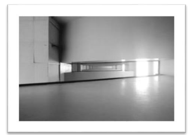
Figure 4. John's photo represents the program; you know it's challenge, you'll be want to stop. There's stairs so others can get there you'll have to power. The light milestones along the destination, but points take a breath, see how know that you're

- Staircase: "This beginning of the PhD going to be a wearied at times and enough room on the climb with you, but to do it under your own represents the way-they aren't the at which you can far you've come, and closer to the top."