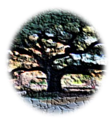
Figure 2. Carlos' photothe trunk of the tree. But program I have begun as well as my thought

Tree: "I was very singular similar to as I have navigated through the branch out and expand as a person process and critical thinking."