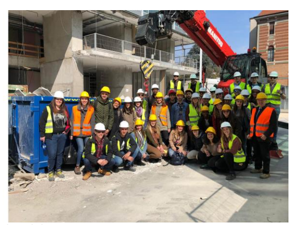
Fig. 2. Building site visits.

Cope & Watts [3] explained that individuals learn from experiences and failures. In this regard, the second week is characterized by the fact that the working groups exchange among themselves the projects that have been developed during the first week of the workshop. The goal is to lead each working group to analyse and understand a project developed by others, which may have strengths and weaknesses. This is a challenge for the groups [4], which leads them to question why some choices have been made and to find solutions for the optimization of projects.