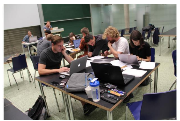
Fig. 1. Working groups activities.

Participating students (attending the last two years of a MSc course) are selected through an open call procedure based on curriculum vitae, earned credits, weighted average of marks (regularly registered by the deadline of the call) and motivation letter. As mentioned above, the working groups are formed in order to have students with different backgrounds, characterized by a mix of skills and competencies. This has the aim of ensuring that each student can give a personal contribution to the development of the project, but at the same time can learn how to face a problem from new points of view. In this way, students can learn and exchange knowledge with each other, under the guidance of the workshop supervisors.