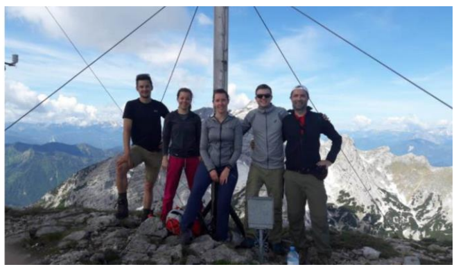
Fig.4. Workshop in a traditional vineyard (on the left) and free time activities (on the right).

The excellent and creative results of the students are related to some aspects, which have been highlighted in all the editions carried out so far. In particular, the main ones are: