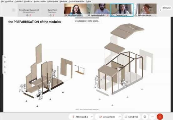
Fig.5. The ACME 2021 edition was held online using a platform with virtual classrooms.