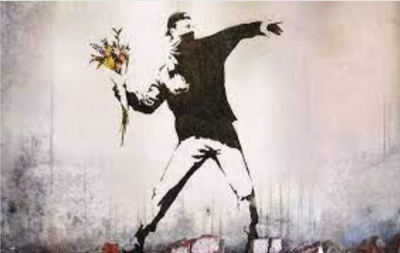
Love is in the Air, Flower Thrower, Banksy, Jerusalem, 2005

Education, in the final analysis, is really about the production of agency.