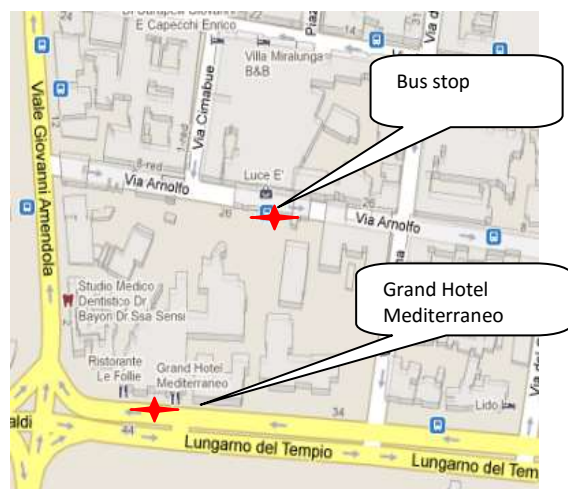
Grand Hotel Mediterraneo, Lungarno del Tempio, 44