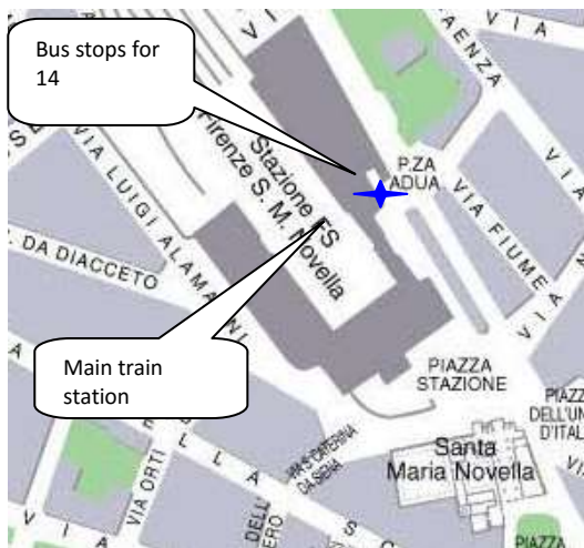
Main Florence Train station "Santa Maria Novella"

From Santa Maria Novella Train Station you should take bus n.14 direction "Ripa" or "Girone" and get of the bus in Via Arnolfo (ask to the bus driver). The cost of the ticket is 1,20 euro. Remember to stamp the ticket once on the bus otherwise the ticket is not valid and you may get a fine.