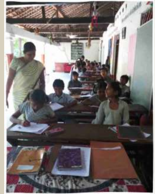
An Elementary/Primary school in Tejgadh