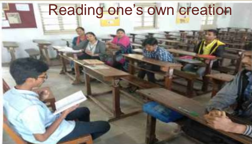
Reading one's own creation