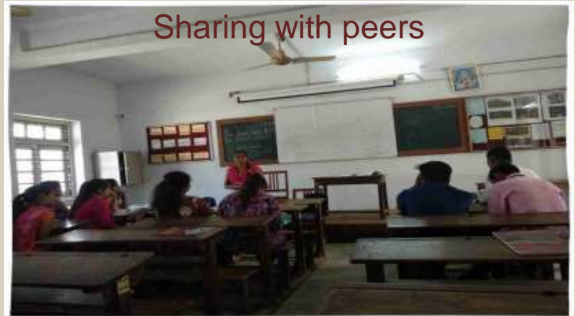
Sharing with peers