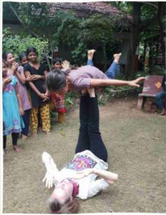
A Research Scholar of Tejgadh Academy With tribal students