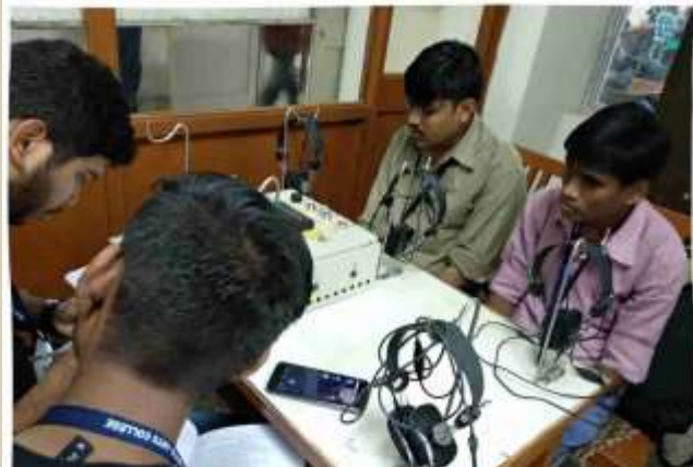
Visually Impaired Students