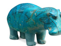
ἵπποπόταμος WoLLow the HiPPo