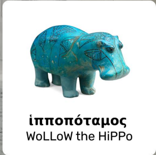
ἵπποπόταμος WOLLOw the HIPPO