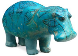
ἵπποπόταμος WoLLoW the HiPPo

1. Understanding of languages: how they work.