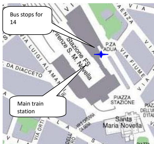
Main Florence Train station "Santa Maria Novella"

From Santa Maria Novella Train Station you should take bus n.14 direction "Ripa" or "Girone" and get off the bus in Via Arnolfo (ask to the bus driver). The cost of the ticket is 1,20 €. Remember to stamp the ticket once on the bus otherwise the ticket is not valid and you may get a fine.