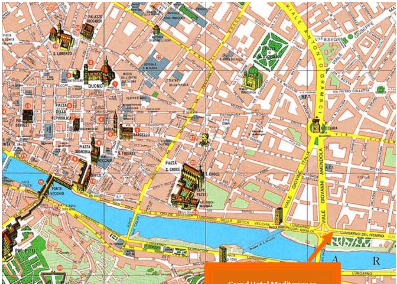
Grand Hotel Mediterraneo Conference Venue