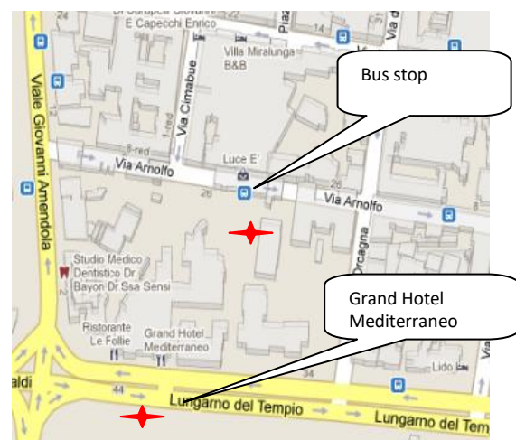
Grand Hotel Mediterraneo, Lungarno del Tempo, 44