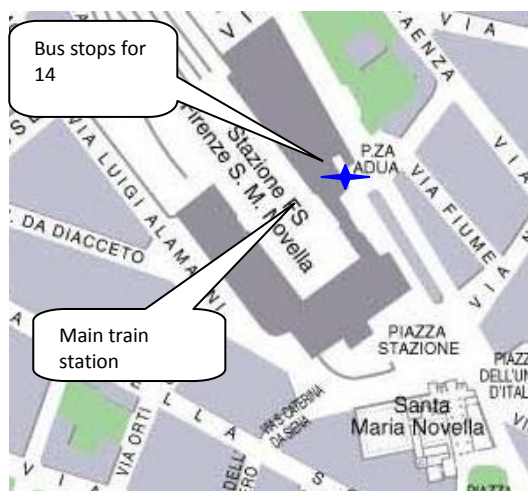
Main Florence Train station "Santa Maria Novella"

From Santa Maria Novella Train Station you should take bus n.14 direction "Ripa" or "Girone" and get off the bus in Via Arnolfo (ask to the bus driver). The cost of the ticket is 1,20 euro. Remember to stamp the ticket once on the bus otherwise the ticket is not valid and you may get a fine.