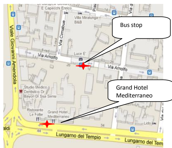
Grand Hotel Mediterraneo, Lungarno del Tempio, 44