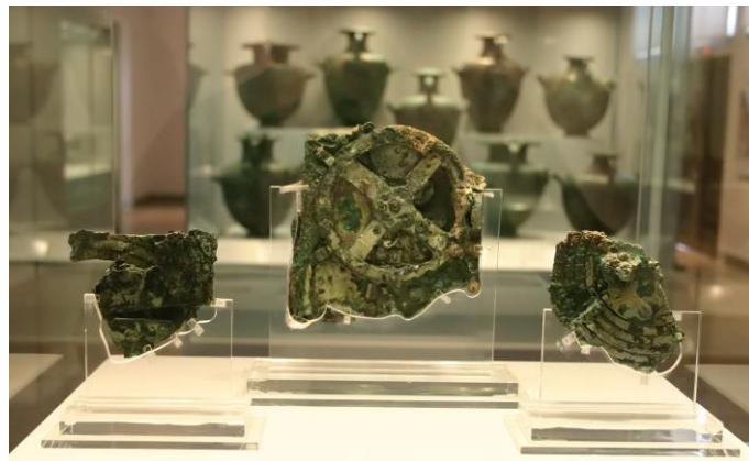
Fig.1. The main fragments of the Antikythera Mechanism as displayed at the National Archaeological Museum of Athens, Greece.

accidentally in 1901 by sponge divers at the bottom of the sea in a shipwreck near the island of Antikythera in Greece. Its complexity astonished, and continues to amaze, the international community of experts and historians on the ancient world as it is technically more complex than any known device for at least a millennium afterwards. Research over the last decades gradually revealed its secrets and decoded its operation and specific functions [7,8]. It is now known that it calculated and displayed astronomical information, particularly cycles such as the phases of the moon, the motions of the sun and the moon across the zodiac along with luni-solar calendars used in ancient times. The mechanism also predicted lunar and solar eclipses and displayed information on periodic events of social significance in the ancient world such as the Olympiad and other important Panhellenic Games. In a nutshell, the device is a mechanical realization of the scientific knowledge and understanding of the cosmos of that epoch. It is internationally known as an artefact of unprecedented human ingenuity and scientific, historic and symbolic value. Since its discovery it has inspired scientists and engineers with its degree of technical and scientific sophistication. Similarly it can stimulate, inspire and engage young students through interdisciplinary educational activities that naturally combine science, technology, engineering and mathematics subjects.