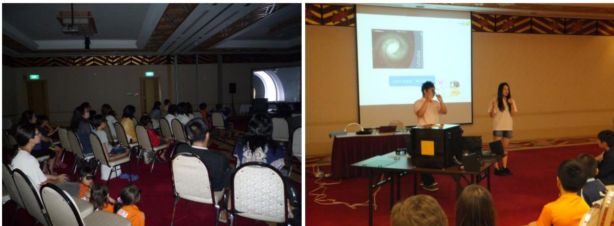
Fig.6. Photographs of the MITAKA class.

Mitaka classes were performed using the SORa Cube system in the Japanese Association, Singapore on September 1, 2012. The class was taught four times, and the schoolchildren and 130 or more guardians enjoyed the presentation on cosmic science. After the class, a questionnaire survey was done among the guardians. The results showed that all guardians were very satisfied with the class.