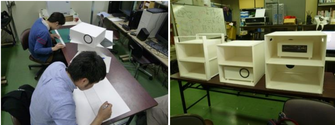
Fig.3. Prototype Production by Students.

could be processed easily. Students processed the boards by using a cutter, vinyl tape, and a glue gun. To verify the size and feeling of the 3D system, three prototypes were produced. Finally, the prototypes of the student productions were verified by an industrial designer and an engineer. Figure 4 shows the appearance of the verified prototypes.