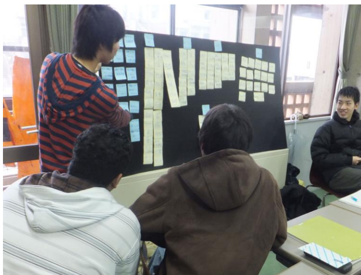
Fig.1. Figure 1. Scene of Brainstorming by Students.