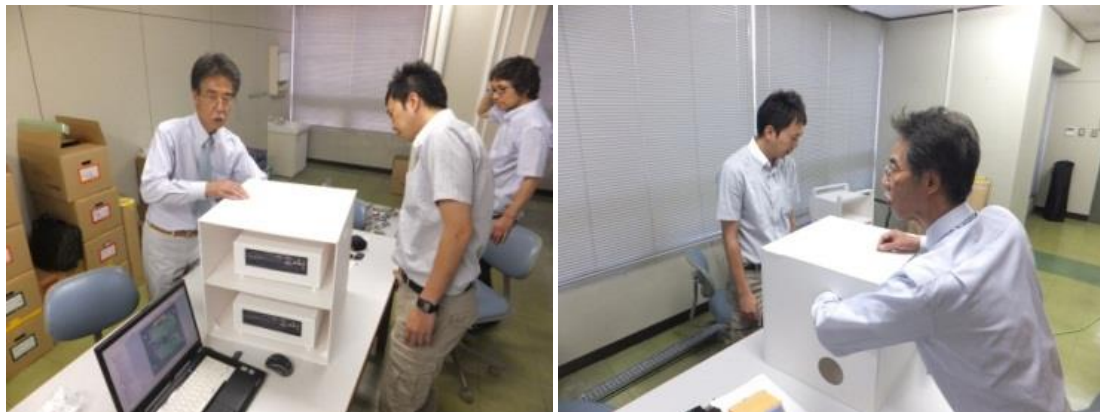
Fig.4. Verification by Industrial Designer and Engineer.

The final drawing was made based on the verification result, and a 3D system was produced. Figure 5 shows the actual 3D projection system. To keep the system strong, the structure was made in the shape of a cube. Therefore, the system was named SORa Cube. Two DLP projectors were set up in the cube, heat radiation fans and circularly polarizing plates were installed in the pre-cover of the cube. In addition, there was function to adjust the position of the image easily in the Cube. The system can be loaded into the airplane without an extra charge.