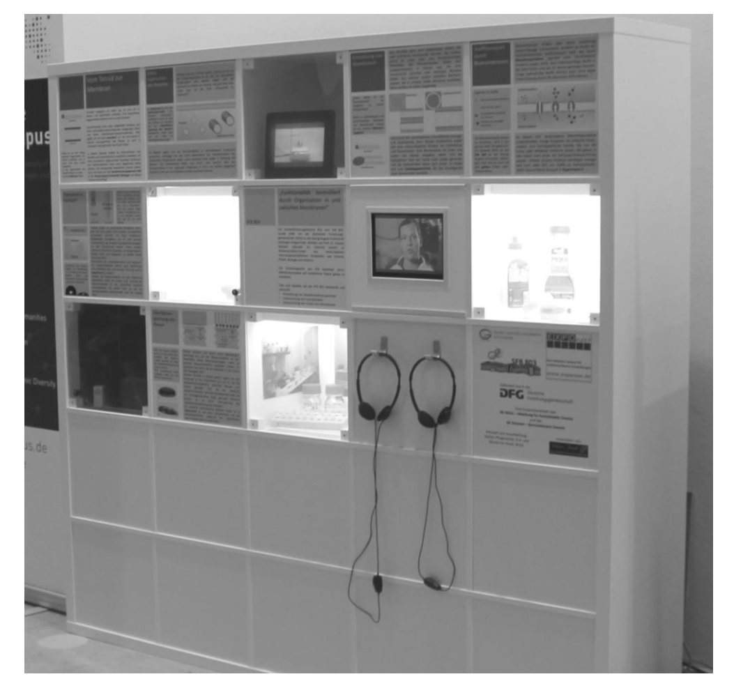
Fig. 1. EXPOneer exhibition piece with informational texts, figures, illustrations and press-the-button experiments.

The science fair concept developed by this group started off with an EXPOneer [6] exhibition piece as its central element. It is based on a teaching unit titled 'From Surfactants to Biomembranes' [7], and contains a number of informational texts, figures, illustrations and press-the-button experiments, introducing principle concepts pertaining biomembranes to people with varying scientific knowledge and backgrounds (Figure 1).