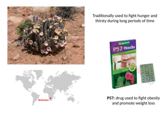
Fig.2. Example used during task 3 (biodiversity and drug production)

The teacher's impressions about the experience of working with TLS were generally positive. During the experience, she seemed satisfied with the current results, especially with students' engagement and questioning, and also noted how even students considered by the school as part of the low abilities group were also participating and interested in the lessons.