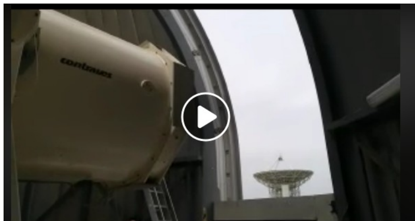
Fig.3: Our working group at the C.Colombo space station in Matera (ITALY)