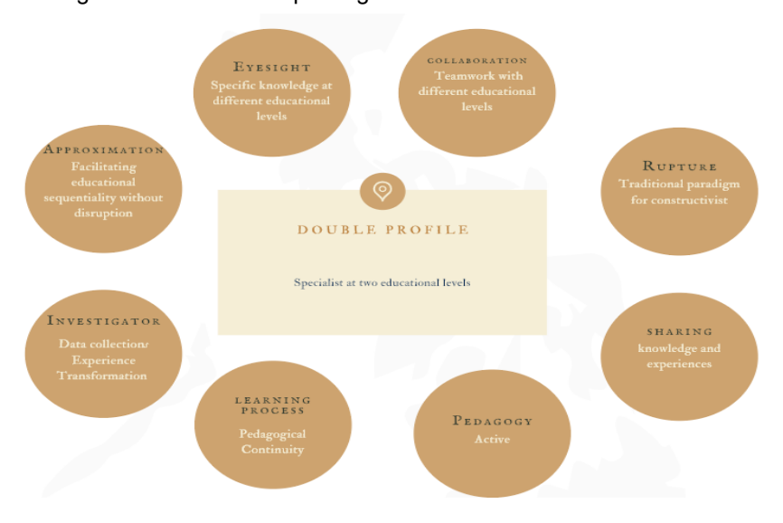
Figure 2. The Method of Project in the construction of the double training profile

What do future teachers say about the contribution of the Project Method to the double profile? We have selected keywords from their discourse (Figure 2) that show that the Project Method fosters a vision of the two educational levels, favouring educational sequentiality and pedagogical continuity, team work and the sharing of knowledge and experiences, stimulates research and an active methodology that changes the educational paradigm.