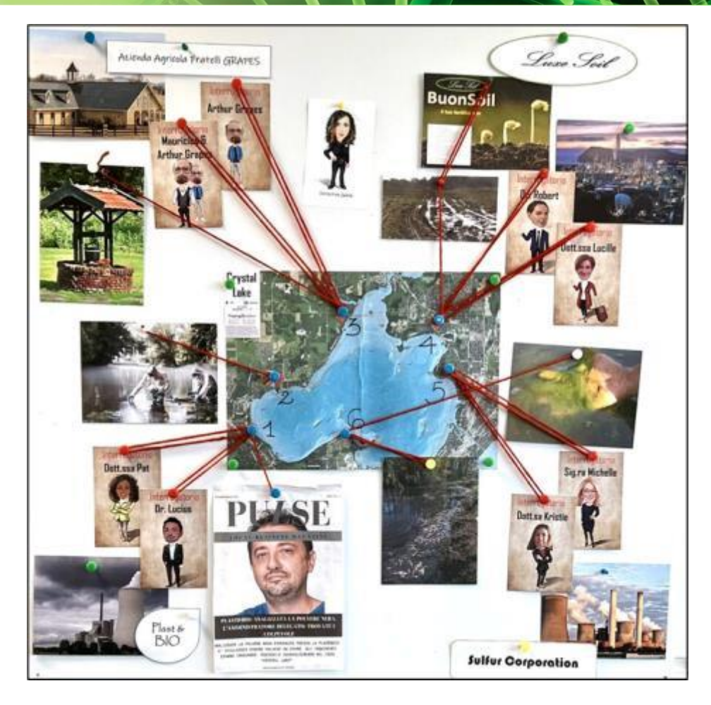
Fig.1. The Detective Board with the four suspected companies.