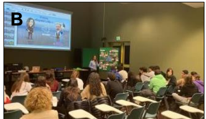
Fig.3. A) Game testing session with a Focus Group and B) Game session during the XX Conference of the Research Language.