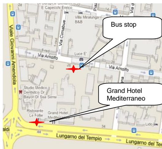
Grand Hotel Mediterraneo, Lungarno del Tempo, 44