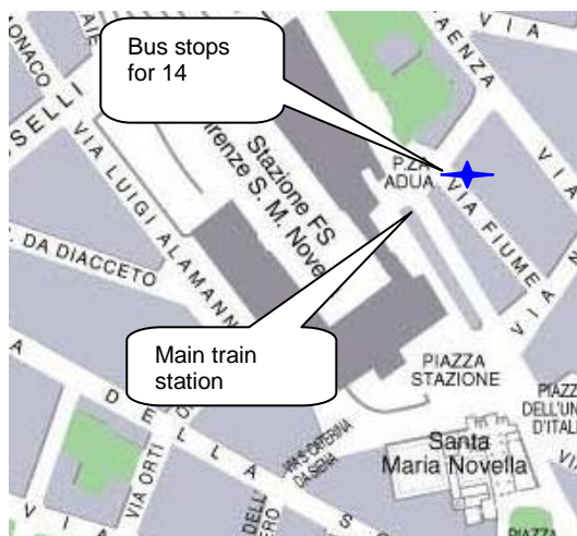
Main Florence Train station "Santa Maria Novella"

From Santa Maria Novella Train Station you should take bus n.14 direction "Ripa" or "Girone" and get off the bus in Via Arnolfo (ask to the bus driver). The cost of the ticket is 1,20 euro. Remember to stamp the ticket once on the bus otherwise the ticket is not valid and you may get a fine.