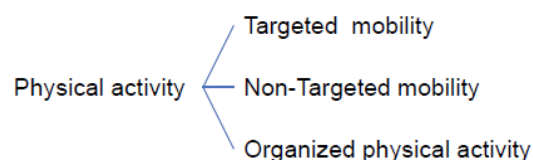
Fig.2. Physical activity can occur in three ways

All modern management concepts (for example lean management, total quality management and business process engineering) consider targeted mobility as the most effective way of improving the company's and the employees' efficiency during their working hours. Walking around with no specific destination may be fruitful, but the appearance of doing nothing is not perceived as effective in today's work atmosphere. And organized physical activities typically take place after work.