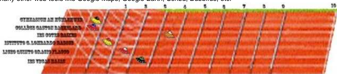
Fig. 2 The results of the competition in problem solving among pupils

The activities were carried out through the use of many web resources, pupils could choose depending on their needs. They used gmail, Twinspace, Google Docs to communicate; Wikipedia such as information source; Calameo, SlideBoom, Slideshare, Prezi to share presentations; Youtube, Ivoox, dotSub, Imagelcop, Flickr, Expono to share multimedia; Google Sites, Blogger, Ning, TwinSpace for publication and dissemination; and many other web tools like Google Maps, Google Earth, Scribd, Bubbl.us, etc.