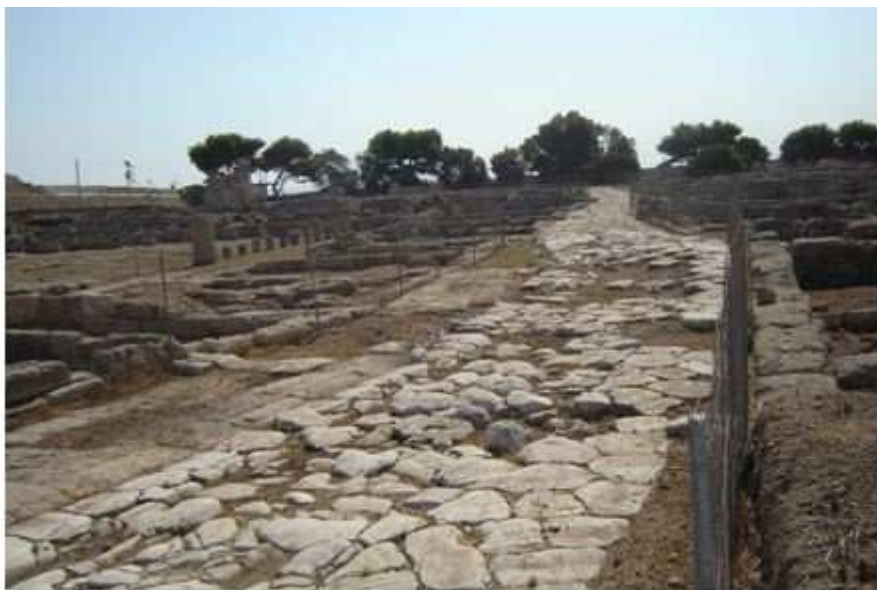
Fig. 3 Egnazia - Via Traiana: a set for our short movie

Creating this film is a funny and useful experience for our pupils. They chose ideas for the plot and they are responsible to write the storyboard. We are shooting in places, close to our schools, where Roman monuments left their imprint in our respective territory. That's one of our common denominators!