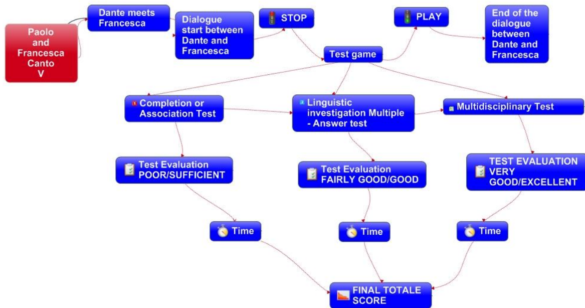
Fig. 2. An example of application to Human Science