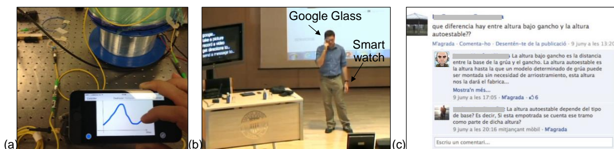
Fig. 3. Examples of using ICTs at UPV: (a) employing students mobile devices for solving short exercises during the lesson, (b) wearable devices for more effective lecturing and (c) social media for faster communication

Incorporating novel ICTs to Higher Education lecturing also improves students' motivation [8]. The possibility of real-time interaction with the students during a lesson was enabled recently due to the pervasive presence of widespread mobile technologies such as laptops, smartphones and tablets. In this section, we summarize different ICT usage examples implemented in lectures at UPV Degrees in Telecommunication, Building and Civil Engineering.