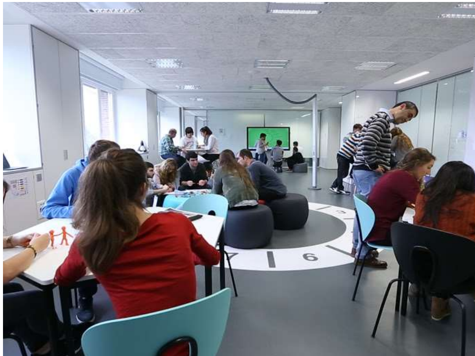
Fig.3. New learning spaces

The implementation of these new methodologies requires a modern learning setting, equipment, furniture and attractive spaces, away from those we see in most training centres nowadays. Their design should aim at putting at our disposal interconnected, flexible open spaces which unleash creativity and originate warm atmospheres, ideal for practicing active-collaborative experiences.