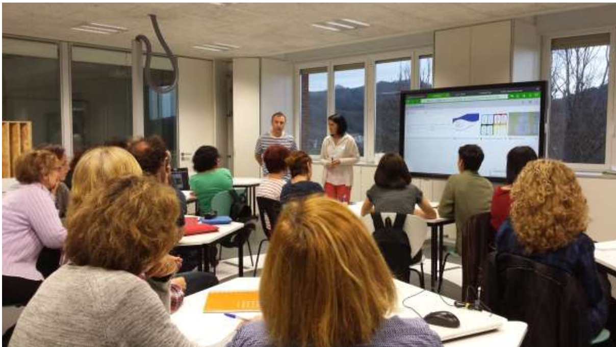
Fig.4. Training courses about Ethazi model in Tknika

Given its relevance, we are working, at Tknika, on the provision of a wide range of training programmes aimed at VET teachers that will drive the methodological change in the Vocational Training centres of the Basque Country in the coming years.