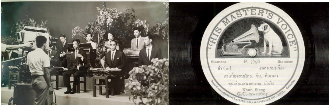
Entertainment media for learning by Thai String ensemble

Thai music circle and creating a new learning process independent of the dominance of schools of music. People could come together in their free time after work or at weekends to play music as a recreational activity.