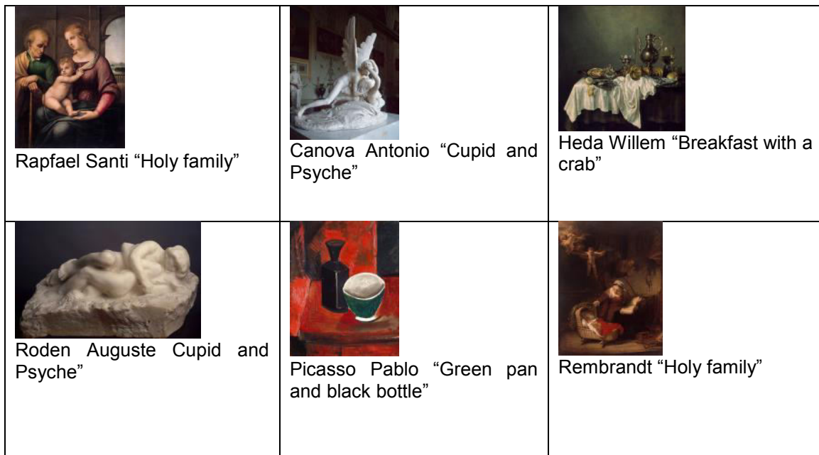
Fig. 1. The stimulus material: well-known masterpieces (2011)

One feature of the research of classical art (N=40) is that we have put together an experimental study of art perception with the study of emotional experience and involvement by the individual's own life experience for understanding the impact of works of art. Six well-known masterpieces were used as the stimulus material.