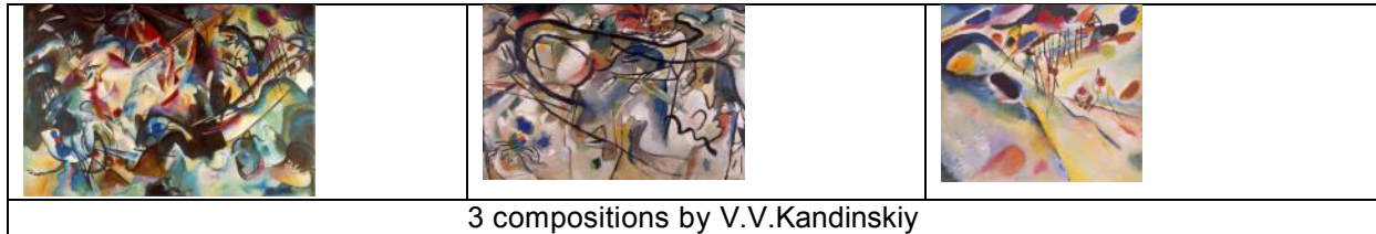
Fig. 4. Stimulus material: three abstract compositions (2017)

Consciousness evaluation of paintings was significantly higher than results of measurement of organismic reactions. It was decided to use participant's associations as spontaneous evaluation. Participants attributed evaluation of associations: directly to the work of art, to the Museum, personal perceptive feelings, and personal experience. Three components of attributive association's factor were selected. Positive emotional value was attributed to the synthesis of perception and painting (,783; ,809; ,808) low emotional value was attributed to the synthesis of the previous experience and Museum (-,013; ,809; ,840) and contradictory emotional value was attributed to the synthesis of perception, Museum and painting.