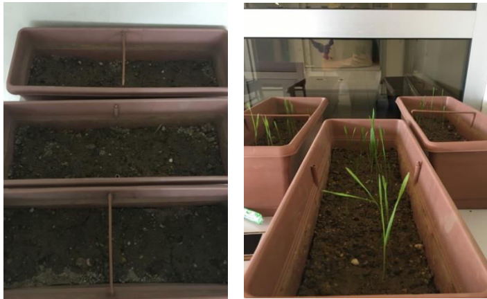
Figure 2. Planted seeds and sprouts

Seeds were soaked in water and chitosan solutions