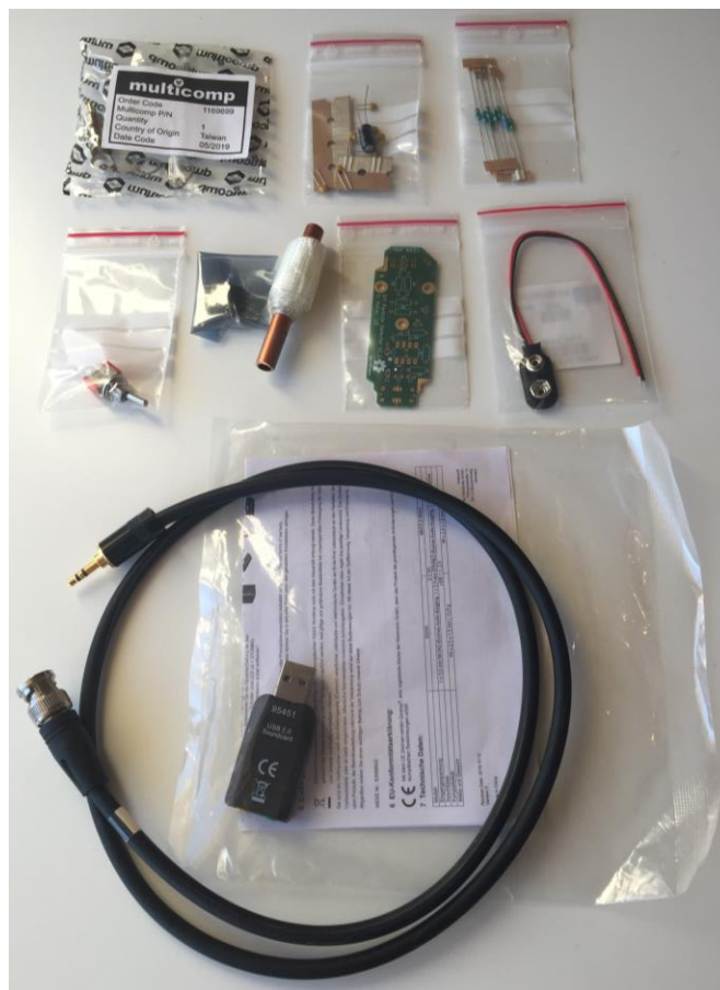
Fig. 2. Components of the particle spectrometer.

The mechanism for the operation of the particle spectrometer is based on electrical charge that is generated on photodiodes. The charges form electrical currents which are amplified and converted into compatible pulses with audio signal inputs. The values of the pulse are proportional to the energy deposited. For the relevant values of the energy, the calibration with sources and its detector is needed. The measured spectrum of energies and open-source software enables real time display and attractive analyses. The spectrometer is relevant for measuring alpha-particles and electrons with energies from 30 keV up to 8 MeV. the components are made for exploring natural and synthetic radioactive sources.