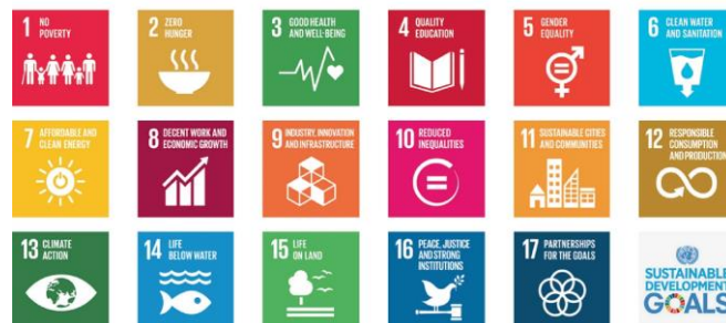
Fig. 1 The SDGs

Reading through the UN Sustainable Development papers, an attempt was made to identify particular targets where arts education may make an impact. All conceivable 'challenges of today' addressed in the Seoul agenda may be absorbed within the SDG content. As a result, we can demonstrate that there is a relationship between the general aims of the United Nations or UNESCO and the purposes of arts education. Arts education has the capacity to achieve ESD goals via creative techniques. Education for Sustainable Progress is ultimately about seeing and moulding the future.[3]