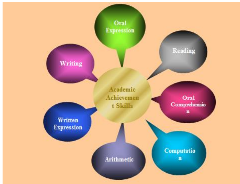
Fig. 4.3 Academic Achievements Skills

These tests are used to determine whether the skills have been mastered in Arabic Language and Mathematics, in accordance with the National Curriculum. They are used with the students of different levels starting from the primary level till the high studies level. They vary in terms of nature of materials and the student's level, as well as the difference in standards and its validity and reliability standards. In reference to BDA chapter 3 which consists of academic achievement tests of two core subject matter (Arabic and Math), that are curriculum based referenced tests from grades 1 – 5.