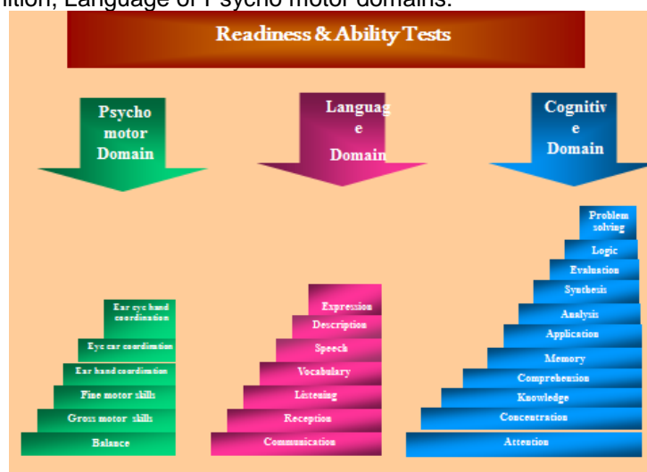
Fig. 4.1. Readiness and ability tests

There are many Group Intelligence Tests, but in Lebanon and the Arab World we are suffering from a dearth of developed and standardized Group Intelligence Tests to be applied in the environment. In this regard, the BDA remains to be the most prominent test to be applied in Lebanon. Children with Special Needs deviate from the normal curve in one or more of the following developmental domains: cognitive, linguistic, emotional, and sensory – motor. Some could be experiencing some learning difficulties, sensory/ motor deficits, auditory or visual perception problems, problems with adaptive behavior, or suffer from speech and language disorders, which may lead to school delay; while others may be experiencing frustration and boredom in classrooms, as the result of the presence of a certain gift or talent in Cognition, Language or Psycho motor domains: