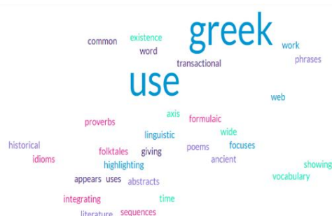
Fig. C.b. - Word Cloud of Learning Game Based Approach. Original diagram