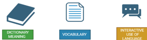
Fig. B. Schematic describing Game Based Learning Approach to Greek Language. Original diagram. Created in https://BioRender.com

Although we do not see vocabulary as an isolated part of language learning; our project aims at teaching vocabulary with a combination of bespoke and dictionary meaning of words according to the level of language fluency variation of contexts of use of vocabulary, exposing the breadth of meanings, motivating interest through immediate feedback and games repeated exposure of vocabulary in different contexts and opportunities to practice (Fig. B). Building upon the Zolotas initiative [3] of using Greek words to speak English [4], we aim at using these Greek words as a starting point for exploration of their meaning in usage and empowering learners to explore the cultural connections and understand their evolution through the ages.