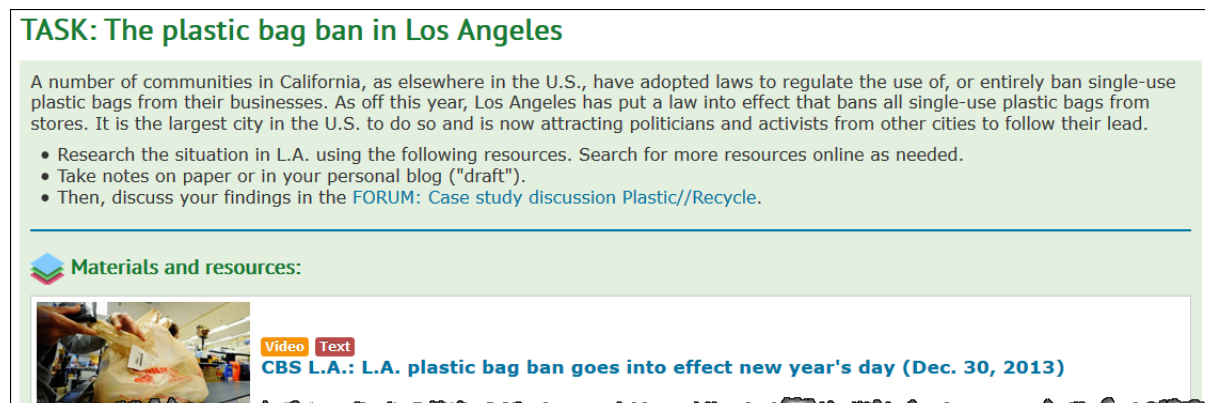
Fig. 1: Screenshot of TASK: The plastic bag ban in Los Angeles

By definition, most of the task-cycles in Going Green fall into this category as they target the thematic framework of sustainability in Germany and the U.S. explicitly. In particular, the research and case study tasks offer a differentiated and often unexpected insight into the target culture, implementing Agar's notion of intercultural rich points. Fig. 1 is a screenshot of the TASK: The plastic bag ban in Los Angeles , a case study in the module about plastic waste and recycling. Learners not only learn factual knowledge about the target culture, but in order to solve the task they need to participate in a forum discussion, aiming at the skills of discovery, interpreting, and relating, thereby also influencing the other categories of Byram's ICC model. Computer-mediated communication here is mainly done in-class.