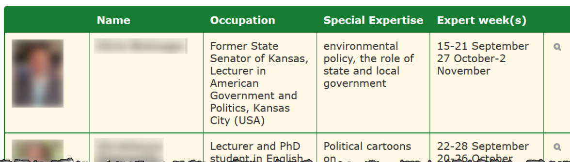
Fig. 3: Screenshot of DATABASE: U.S. sustainability experts

View list View single Search Add entry Export Templates Fields Presets