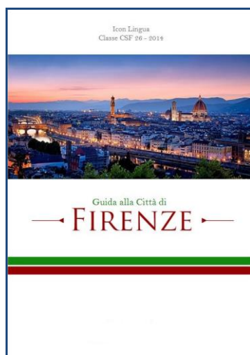
Fig.2. Guide to Florence’s cover, published as pdf by a group of students of Class CsF 26

The guide was published in the forum and presented as a “gift” that the students in the group gave to the whole class.