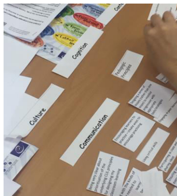
Fig. 1 – Trainees in Podgorica engaged in practical activities