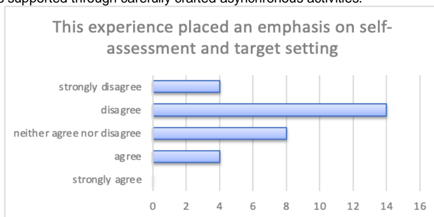
Fig. 1. Impact of the asynchronous language learning experience on self-assessment and target setting

In focus group interviews, students reported that the asynchronous approach to language learning not only enhanced linguistic proficiency but also promoted self-assessment and target setting. In evaluations, students claimed that digital technologies enabled them to plan, to monitor and reflect on their own learning, provide evidence of progress, share insights and come up with creative solutions. This was also evidenced from student work and assignments. Teachers highlighted that learner autonomy was supported through carefully crafted asynchronous activities.