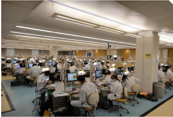
Fig.1. Students working on their typodont while faculty evaluating their progress