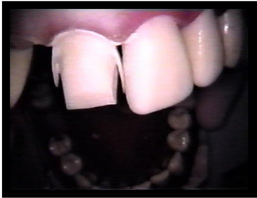
Fig.3B A capture from the DVD showing preparing the facial surface while protecting the neighboring tooth