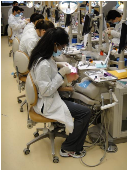
Fig.2 Student Isolating the tooth before starting the preparation