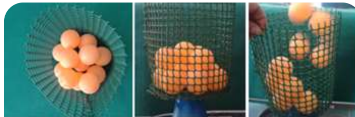
Figure 2: A simple exhibit simulate macroscopically Brownian motion: light balls "agitated" by air flow, are moving chaotically